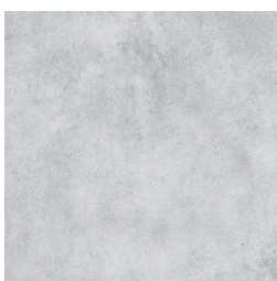
Concrete grey (CB)