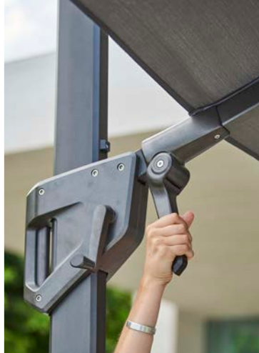
Handle for operating

Aluminium frame, anthracite Pole size 58x88mm 2.3x3.5" 360° rotating / Handle for operating Fabric of 100% Olefin 200gr/m 2 ● 583X3Y504 | dusty white ● 583X3Y505 | anthracite Fabric of 100% solution dyed polyester 280gr/m 2 ● 583X3Y506 | light grey H 270cm 106.3" WxD 300x300cm 118.1x118.1" Base concrete 100kg 220LBS H 5cm 2" WxD 105x105cm 41.3x41.3"