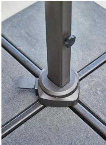
360° rotating / parasol base

Aluminium frame, anthracite Pole size 58x88mm 2.3x3.5" 360° rotating / Handle for operating Fabric of 100% Olefin 200gr/m 2 ● 583X4Y504 | dusty white ● 583X4Y505 | anthracite Fabric of 100% solution dyed polyester 280gr/m 2 ● 583X4Y506 | light grey H 278cm 109.5" WxD 300x400cm 118.1x157.5" Base concrete 100kg 220LBS H 5cm 2" WxD 105x105cm 41.3x41.3"