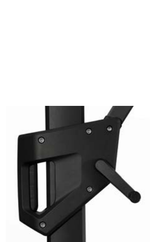
Handle for operating