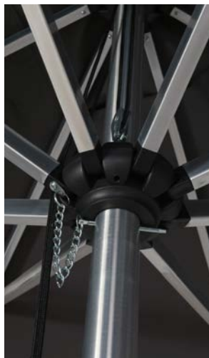
Rope and pulley system