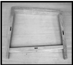
RIGHT END FRAME