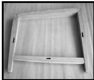
LEFT END FRAME